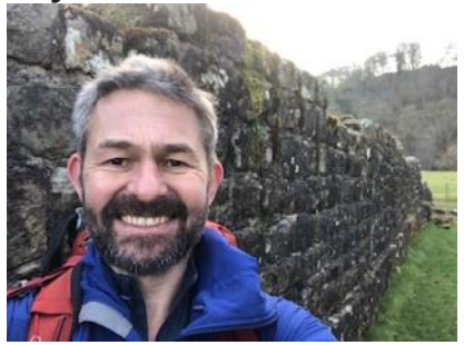
Day 3: Greenhead to Hexam

This section follows huge parts of the original wall and includes the large oak tree famously used in Robin Hood Prince of Thieves movie. A very undulating section that follows the edge of crags which also makes for a very windy walk.