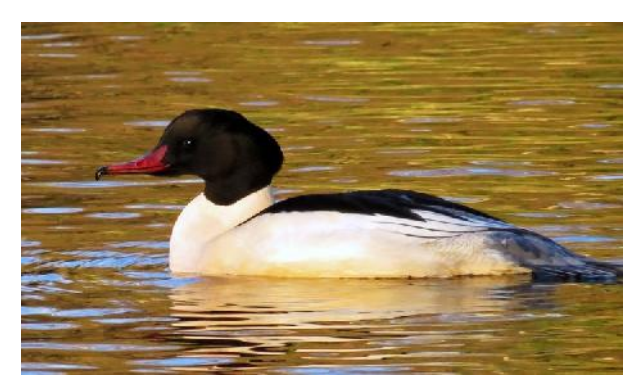
Male (to left) and female goosanders