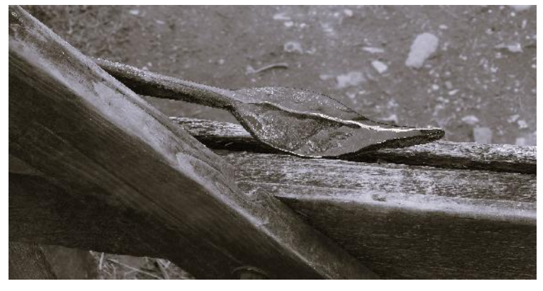
At the gate of the falls path

At the Waterfall a short path takes you easily down from the track into the wooded gorge right to the foot of the main fall.