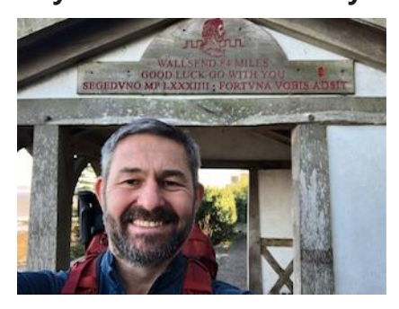
Day 1: Bowness On Solway to Carlisle.

A gentle start with 15 miles flat along the Solway filling trail and road through villages and open land. Arriving in Carlisle and a visit to the Cathedral.