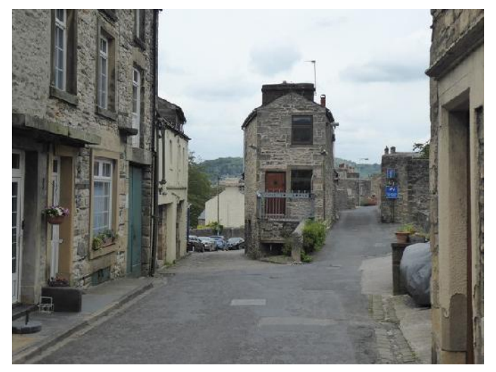
'Junction Lodge' - the 'narrow house' in Upper Settle

Basically one goes N and stays right, especially at a junction at a strange narrow house, to come under the Castlebergh Plantation.