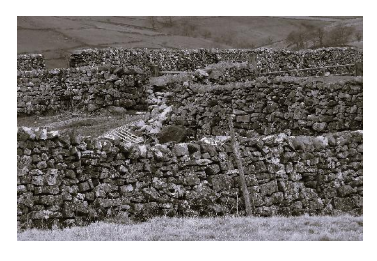
Drystone walls near Winskill

The path crosses the line of the Scar ridge at GR 827663 and carries on to join a track that you follow trending NE, passing just S of (Upper) Winskill farm. Next turn sharp left at GR 832668 to take a crossways track to head N, and then turn left again to pick up the track that goes NW, to pass the gorge of Catrigg Force waterfall. This whole area give good views of Ingleborough, Whernside, and Pen y Ghent, and the rural Dales architecture of farms, barns, and walls is also of interest.