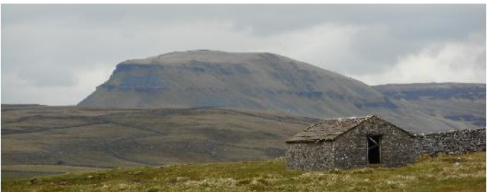
Pen y Ghent from Winskill - with a typical upland Dales barn

found escaping Langcliffe quite difficult, you need to pay attention in the maze of little houses. Unless you want to end up in the kennels and cattery as I did at one stage! Beware of the rather grandly named long distance trails around here – it doesn't necessarily mean the waymarking is better than normal.