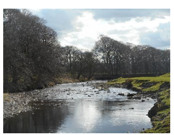
River Ribble South of Settle

Reaching the A59, the footbridge marked on older maps has now gone, but you cross the river by going up to the main road and down again the other side, there is a large verge. The route then follows a track/bridleway E to cross the road into Settle and also the railway. At Hoyman Laithe (GR818621) turn left on a footpath/trackway that goes N, towards the suburb of Upper Settle. On reaching the road, we turn right at go into that village, the Pennine Bridleway soon coming in from the right to join us. Again, here in the village, despite our now being on a national trail, the navigation isn't always obvious.