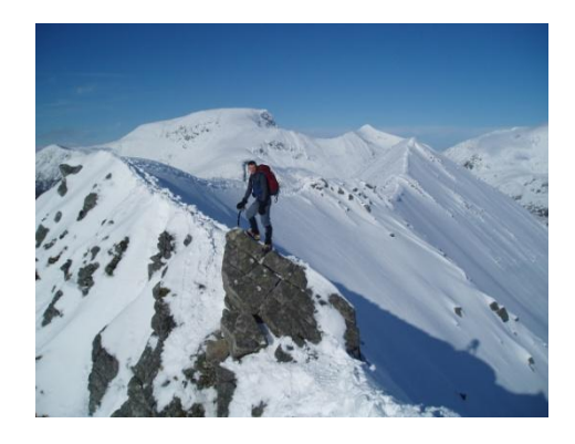
Descent from An Gearanach