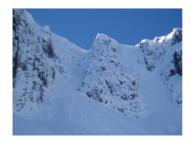
Dorsal Arete – climbers can be seen on the lower Left hand side of the ridge.