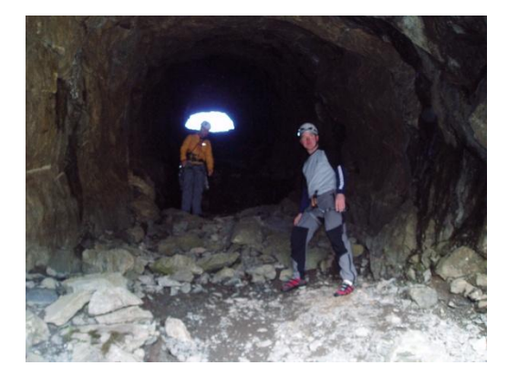
Coming down the descent tunnel on