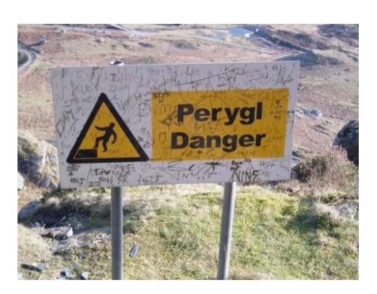
It's not you know!