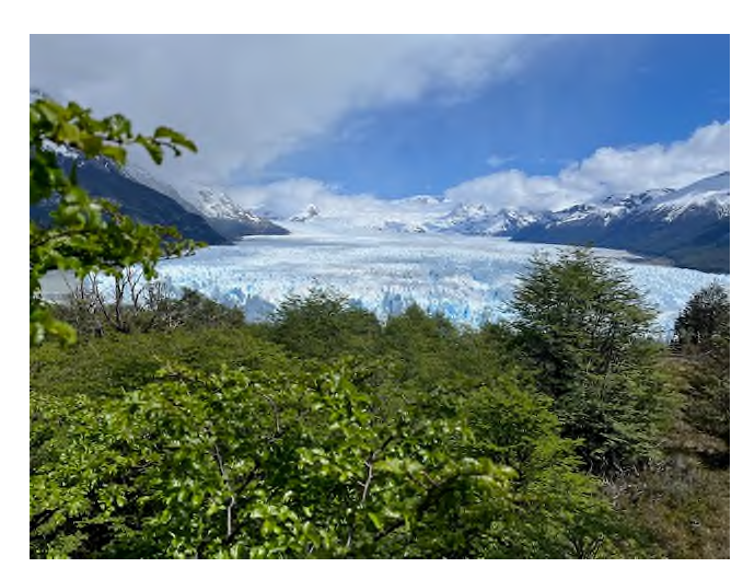
<< Perito Moreno glacier