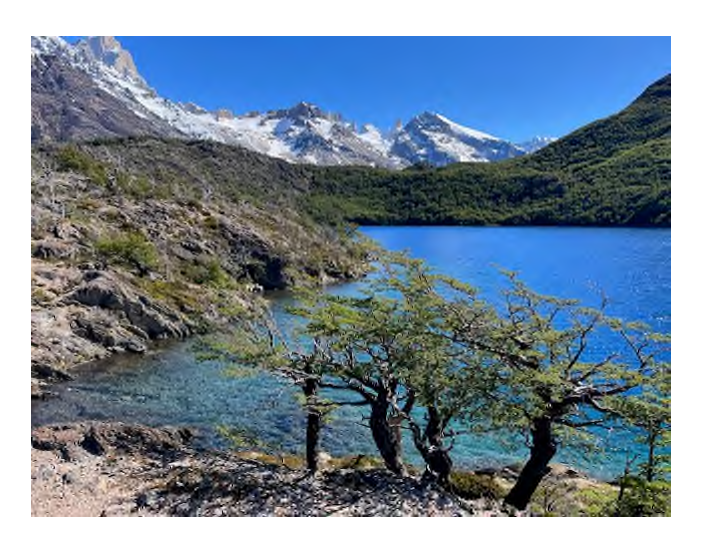
Lenga trees in the foreground

Wildlife on the trip included many birds condors, flamingo, caracaras buzzard eagle, Magellanic woodpeckers rhea and guanacas to name a few. Amazing plants and trees too.