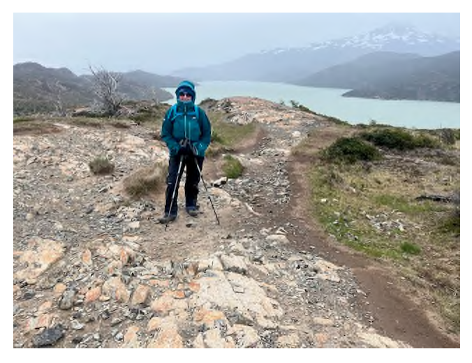
<< Grey day the next day on the way to grey glacier on the w trek

<< Grey glacier first day first sighting of a blue floating iceberg, windy and dry