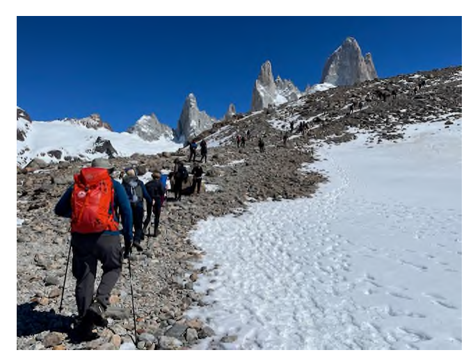
<< Hike to Mount Fitzroy viewpoint at Laguna de Los Tres 14.03 miles 3068ft ascent