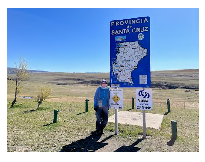
Crossing the Cerro Castillo border into Chile to visit Torres del Paine national park.