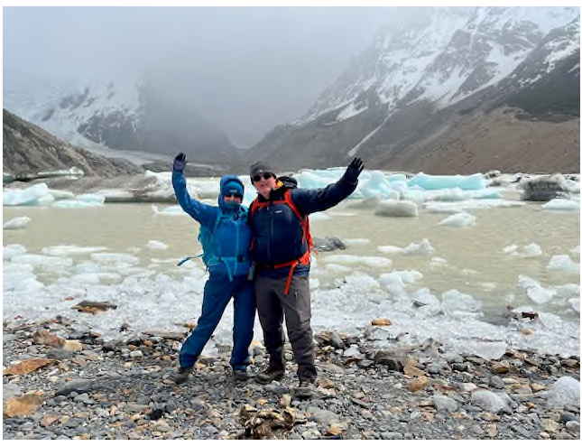
<< Laguna de Los tres with Mount Fitzroy in the background