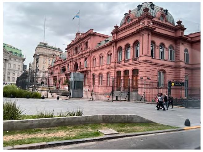
<< Rosada palace with the famous balcony Evita addressed the crowd from.