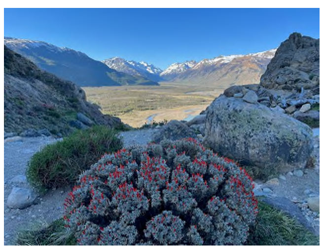
Guanaco bush in flower

In summary an amazing trip great company, stunning mountains, wildlife and lucky with the weather. Definitely a trip of a lifetime.