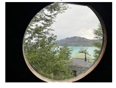
<< View from our Dome at Frances refuge

The only day we had to carry a full rucksack all day on trek was from Frances camping domes alongside Lake Nordenskjold to Chileno refuge (11.57 miles 2712ft ascent) were we camped in their brand new tents with ladders very comfy. Lake Nordenskjold