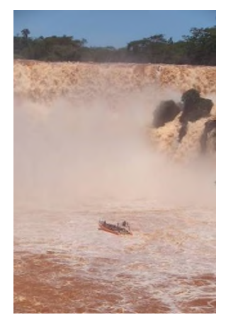
<< Boat trip from the Argentinian side scary but exhilarating!