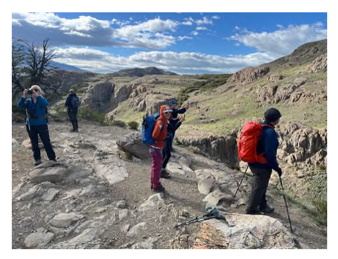
Hike to Cerro Torre viewpoin

<< Amazing scenery on the way up to Cerro Torre viewpoint. 12.83 miles 1756ft ascent