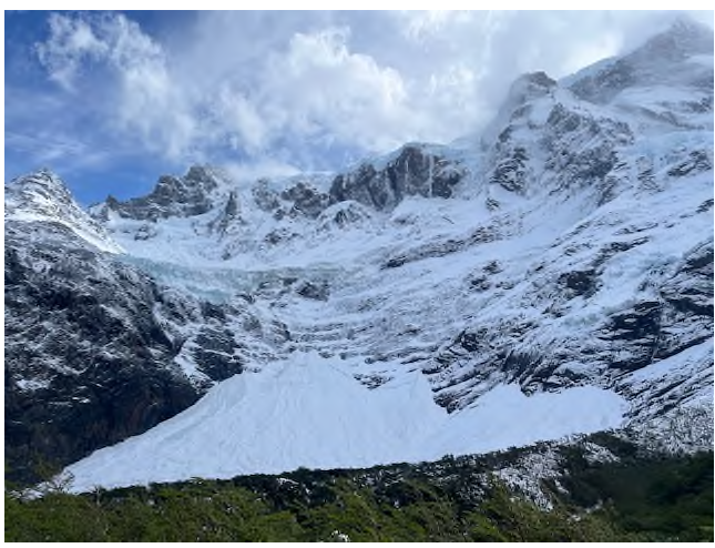
Francis glacier on the hike up the French valley