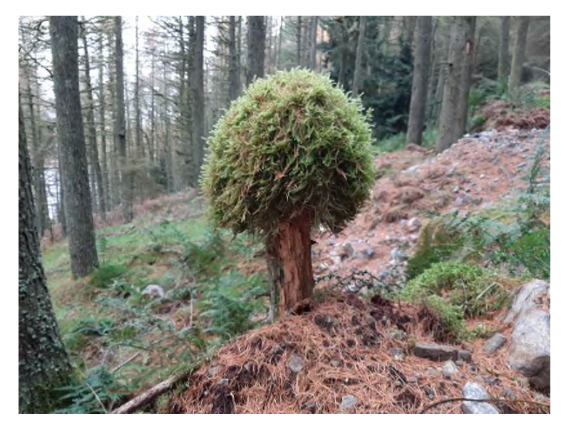
A Chris moss tree