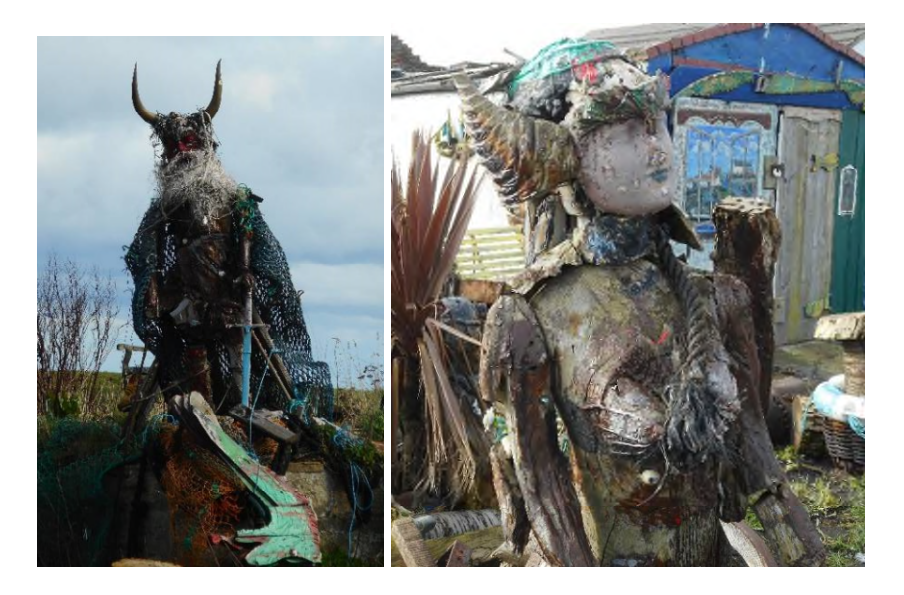
For my second walk I drove about 30 miles north to High Hauxley at the southern end of the big Northumberland beaches, and by beach and coastal dunes path, and inland nature pools, walked the ground between Druridge Bay Nature Reserve and Amble village, as out and backs.