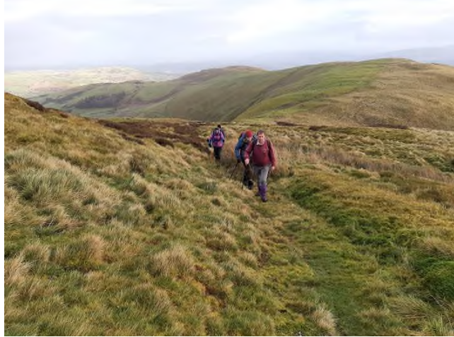
There's a path there, somewhere!