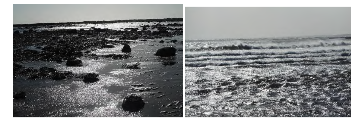
There were good views out to Coquet Island and its lighthouse, and Amble is a pleasant scene set on a sandy bay with low cliffs.

Even on a sunny day the vast lonely beach and shelves of rock felt almost forbidding at times, the sea was angry in a very strong wind. Dark stooped and hooded figures collecting shellfish or bait laboured in silence against a dark background of waves.