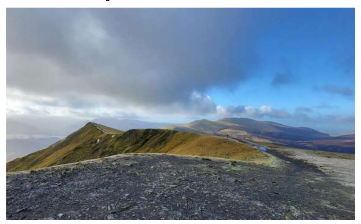
And Bryn on the summit, with Derwentwater in the background...