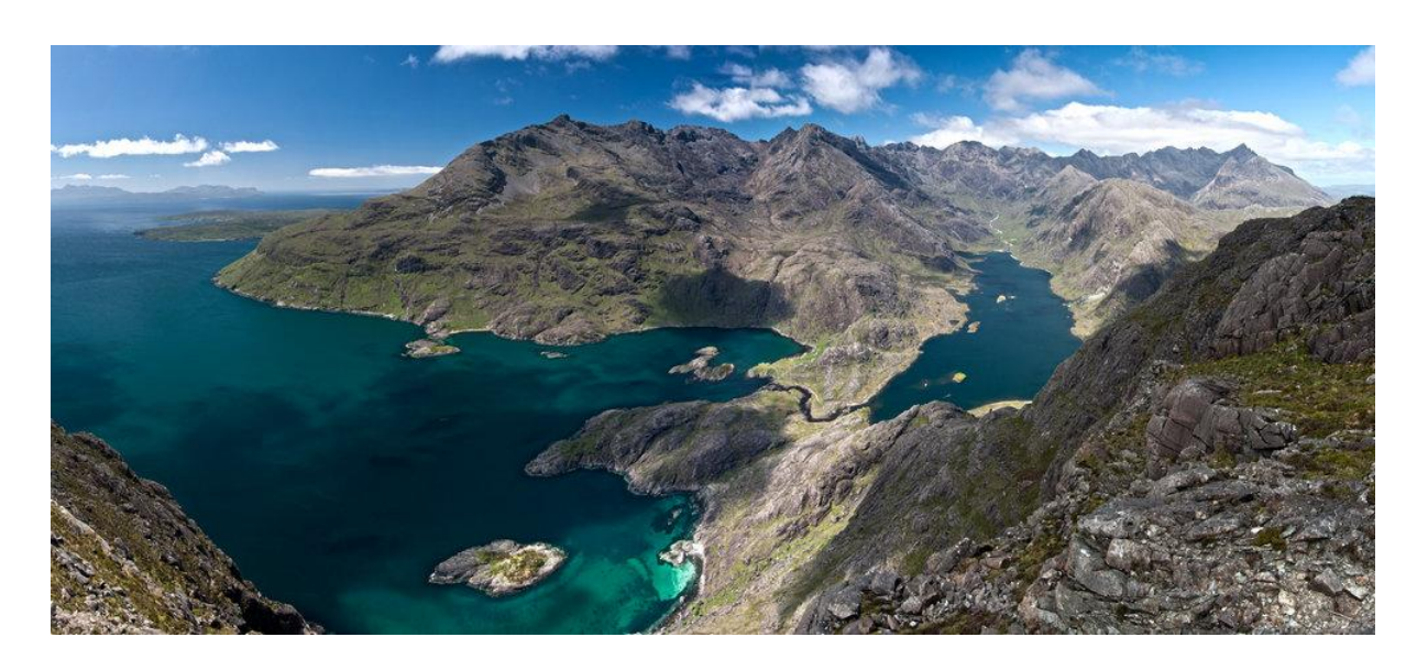
I love this picture! It's the Cuillin in case you were wondering ©

Welcome to this months newsletter and I hope it finds everyone well and looking forward to the Spring © It has been so mild of late though Andy Chapman has emailed me to say there is still some of the white stuff in Scotland if anyone wants to make the journey up north.