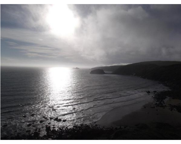
Porth Ysgo – there is some great bouldering here!