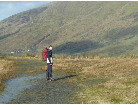
Sentries Ridge & Mynyedd Mawr