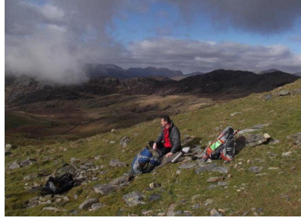
Cnicht Shortly before the mists rolled in ......