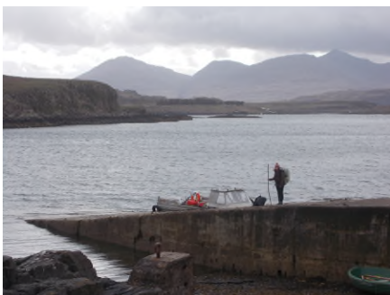
The Ulva ferry terminal

We then split up into small groups to walk around the island and enjoy the stunning sea views, before visiting The Boathouse (the island tearoom)”