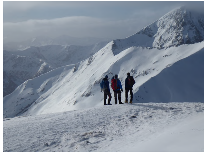
On Aonach Beag – looking to Ben Nevis