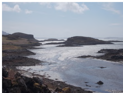
The south coast sea views