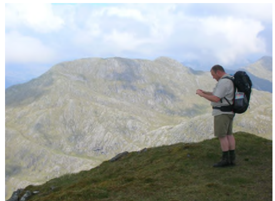
Hew on Meall Bhuidhe

Chris’s walk that day was comparatively short as some very big