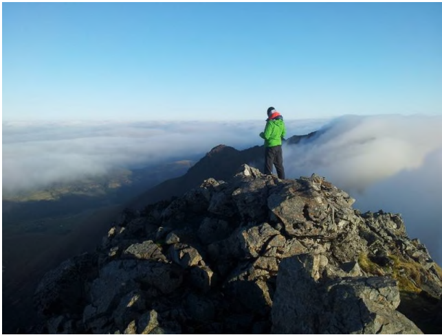
Tara in the morning sun, Sgurr Alasdair