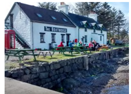
And the Boathouse tearoom