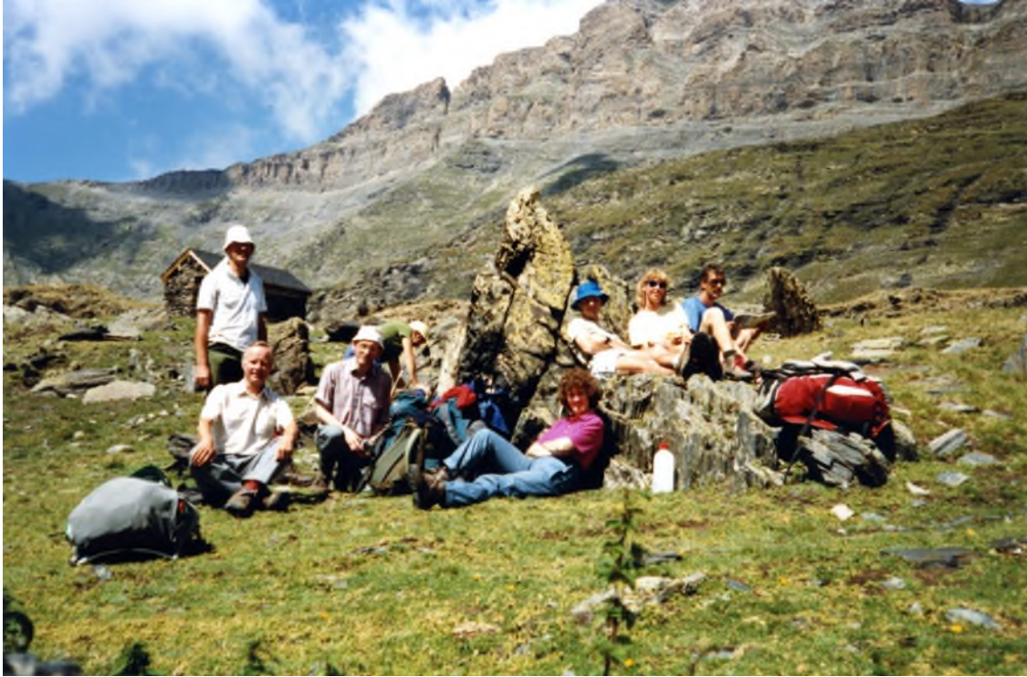
The Gourmet Trekkers at Hourquette de Heas in 1989