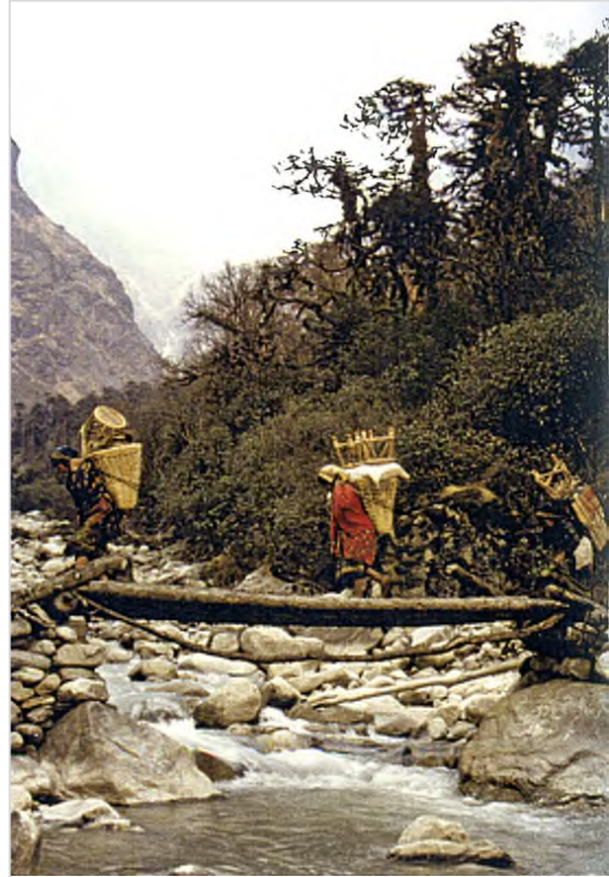
In the Hinku Valley