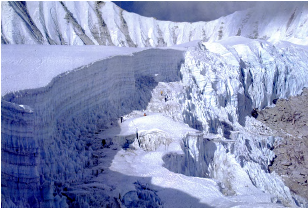
On the Nare glacier