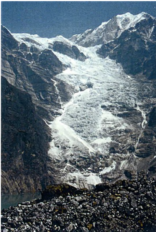
Glacier by Tangnag