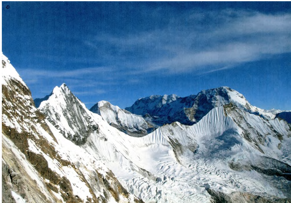
The Mingbo La is at the centre on this photo