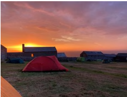
A beautiful sunrise