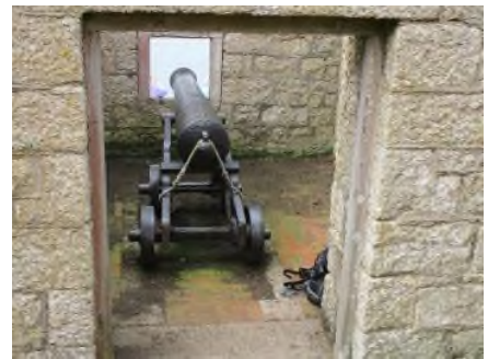
One of the cannons at Battery Point