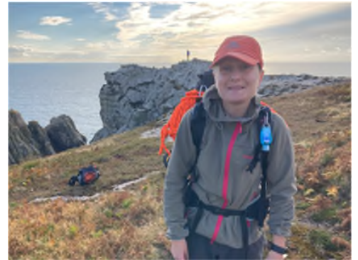
Tired but happy