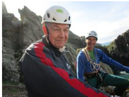
A fellow camper joins us at the abseil point