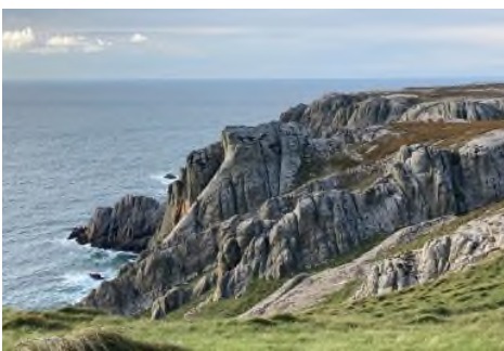
Devil’s Slide viewed from along the coast

Finally we had our one full day with a good weather forecast! Realising it was now or never to take David to do Devil’s Slide, we set off early - too early... We peered over the midway abseil boulder, and realised we’d need to wait a bit if we wanted to reach the lowest point to belay. David was looking up and down the route nervously.