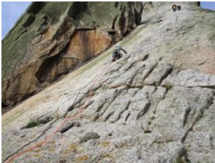
Take 2 - me leading pitch 2

For me, the day then took on an unexpected turn. While slowly working our way up Devil's Slide, I'd been studying it in detail. I'd hoped to persuade Rich to do the VS 4c corner crack route, Albion, after we'd finished, but Rich was feeling tired and didn't fancy it. I joked to him that I thought I now knew the Devil's Slide route well enough to lead it, so he offered me the chance to lead all 4