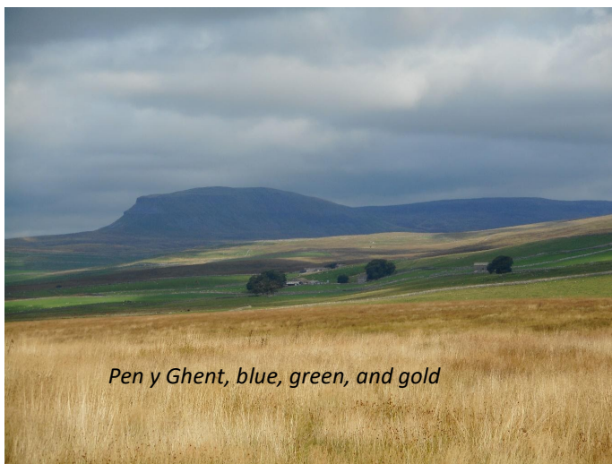
Pen y Ghent, blue, green, and gold

You can easily go a few yards into the cave which is worth the effort to say you've been caving!