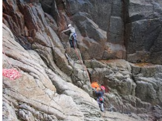
Easy climbing at Picnic Bay Cliff