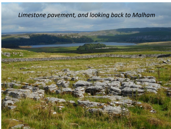
Limestone pavement, and looking back to Malham

The byway crosses areas of grazing called Overclose, Gorbeck and the evocative Outside till we come south of Black Hill and trend SE below a line of small limestone scars to reach a junction with a bridleway at GR 881649. This northern arm of the circuit is very open and wild, a good track going through vast areas of red and golden moor grass. To the north there's great views of the 3 Peaks – Ingleborough, Wharfedale and Pen y Ghent. Further out I saw the distant bulge of Black Combe (from which you can on a very good day see all 6 countries of the British Isles!), looming pallid grey across Morecambe Bay.