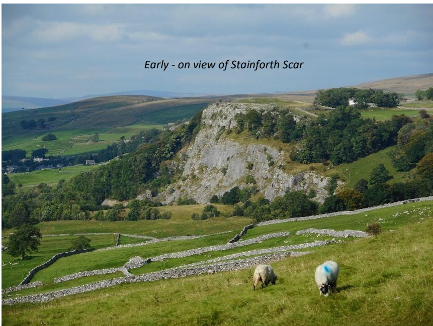
Early - on view of Stainforth Scar

Here is an overview map of the circuit at 1:50,000. This is from OS Landranger sheet 98. It's far easier though to navigate with the 1:25,000 map, which is OS Explorer sheet OL2. I parked at the reasonably large village car park in Langcliffe by the old school, GR 823651. This runs an honesty box, minimum daily charge £2.