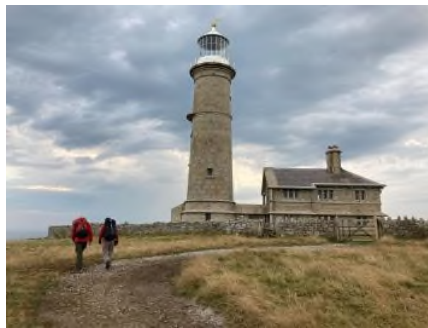
Rich and DLJ set off past the Old Lighthouse