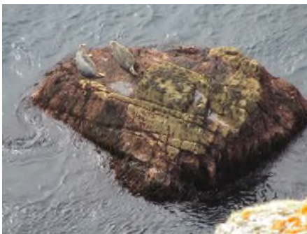
2 seals chilling on a rock at the bottom

Today's forecast didn't look great, and we wanted to find somewhere to get David's confidence up for climbing on Lundy rock. Seal Slab was the perfect place - a dramatic location, but easy climbing (a 55m Diff) that could be climbed in the wet. Oh, but it's surprisingly hard to find from the island's main grassy plateau!