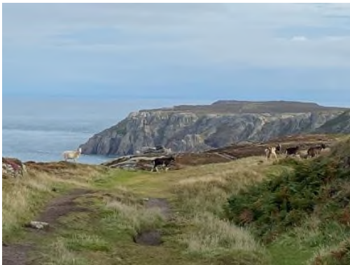
Goats on the way to Beaufort Buttress