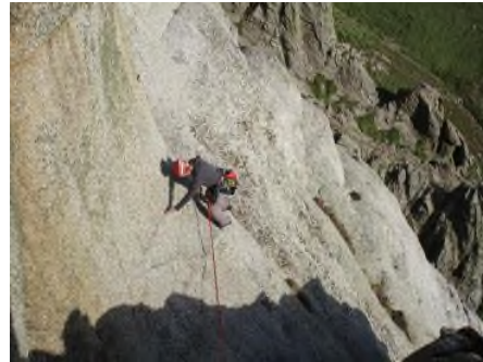
Take 2 - bringing Rich across the 3rd traverse pitch