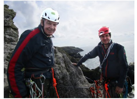
Big smiles at the top!

needed. DLJ was delighted to find that he even enjoyed the final pitch - as it involved climbing big cracks with hand and foot holds, rather than balancing on a slab!