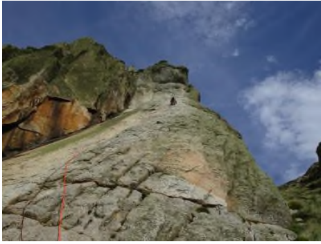
Rich leading the 2nd pitch