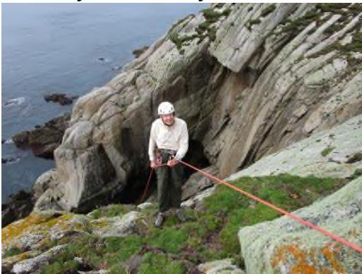
DLJ starting the abseil down