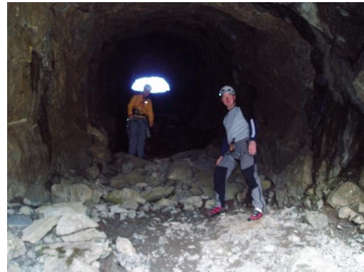
Coming down the descent tunnel on Craig Yr Wrysgan