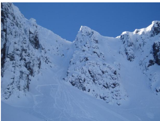
Dorsal Arete – climbers can be seen on the lower