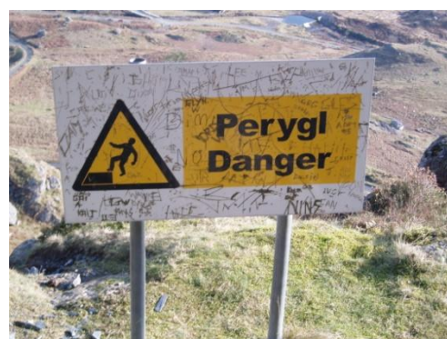
It's not you know !