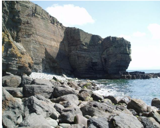
Craig Dorys, the route lies on the wall half in the sun