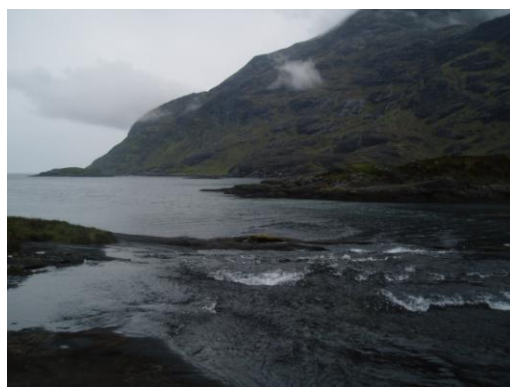
The outflow from Coruisk to Loch Scavaig