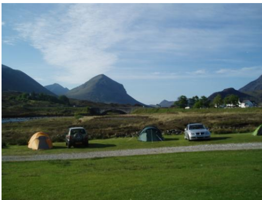
Marsco from the Sligachan Campsite

Mention must be made of this site which is very good and only £5 per person per night, they are clean, the showers are excellent and you are only two minutes walk from the pub which has its own micro brewery.