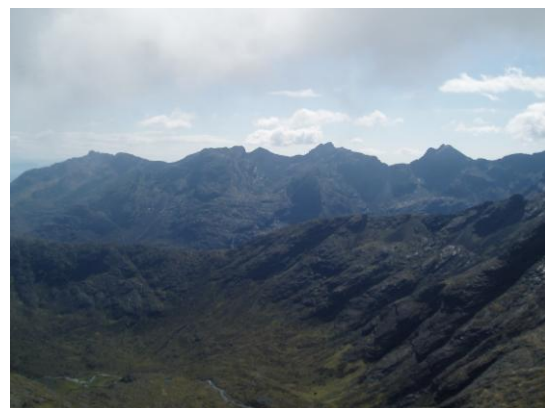
View of the Cuillin ridge from Sgurr Nan Gillean