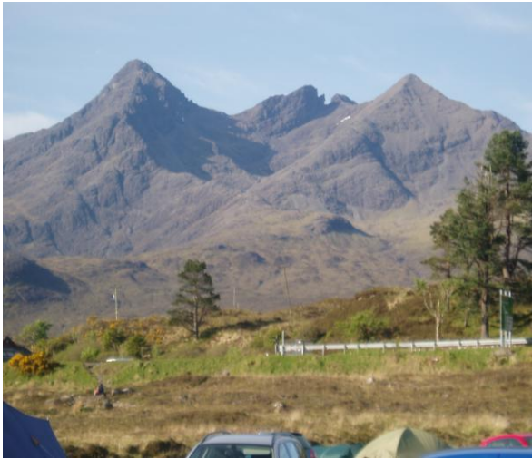
Sgurr Nan Gillean, Pinnacle Ridge is the ridge half

In sunlight / shade on the left of the picture