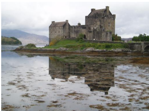
Eileen Donan Castle

Not having walked along Glen Sligachan before I was under the impression that it would not be too far to walk to Loch Coruisk whose shores I had not trod before and only looked down upon from the ridge. So to Coruisk it was though Andy Odger elected to climb Sgurr Hain rather than descend the 1000ft to the loch shore (and the subsequent slog back up as time forbid a walk around the headland to Camasunary and back to Sligachan that way). The scenery was magnificent and there were a number of people wild camping on the shores of Coruisk, a more idyllic camp site could not be imagined and it was with some envy that we began the walk back in a now heavy rain shower to Sligachan.