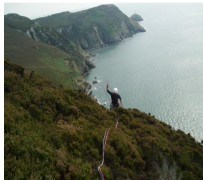
Phil at the top of Bezel