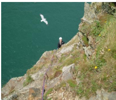
Phil on Lighthouse Arete

An attempt was made to climb on Anglesey again the following day but the weather refused to play ball and we merely walked over to Wen Slab to look at the classic line of 'A Dream of White Horses' before a seriously heavy shower soaked us to the core and gave us no option but to go home.