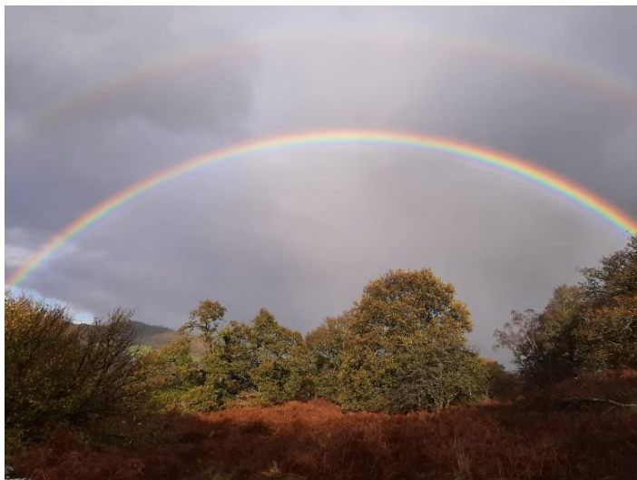
Rainbow over Tan y Garth - view from Dolwyddelan bridleway on bonfire night.