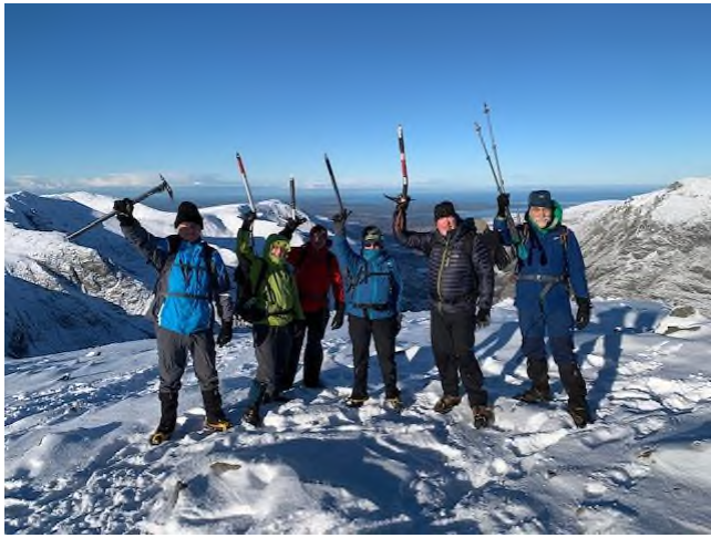
<< Exit from top of Gribin on to Glyder Fawr

The top of Glyder Fawr was a few hundred metres away to our right so we plodded across the snow to the summit, where we had lunch and sunbathed – it was like being on an alpine summit!