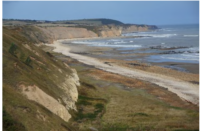
And this is the same area as I found it...