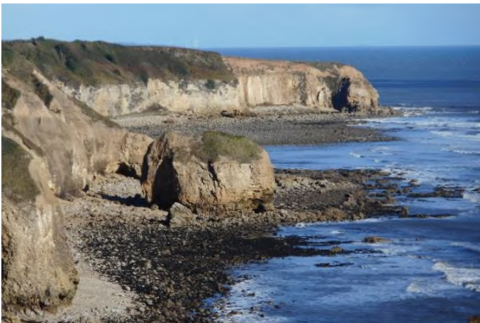
At Shippersea Bay