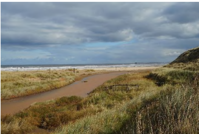
Beach and dune slack at Crimdon Dene

Of the two routes that haven't featured so far, Crimdon to Hartlepool, which I did on the afternoon I arrived, was very different to my other days. It's a vast beach and sand dune system, the beach was the only one locally that never subject to industrial pollution.