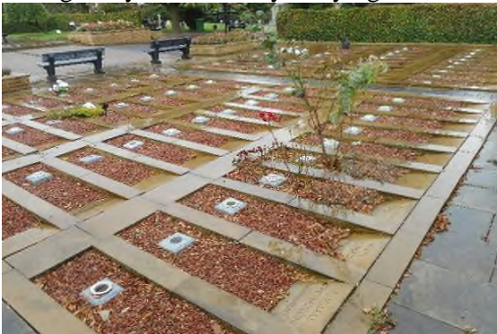
Graves of 1951 Easington Colliery disaster victims

In Easington Village the churchyard has a monument and a mass grave, where lie buried most of the 81 miners and 2 rescuers killed in the 1951 colliery disaster. This was due to an explosion of fire damp (methane gas) and coal gas caused by an inadequate ventilation system, and poor health and safety practices. All but one of the miners died instantly. Also sobering was the deaths of the two rescuers, both youngish men, both caused not only by what sounds to me like outdated breathing apparatus, but from the stresses of the emphysema (COPD) damage they were already carrying in the their bodies.