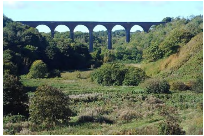
Castle Eden Dene and railway viaduct