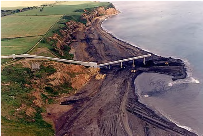
Easington Beach before restoration...