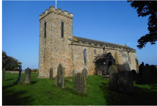
<< North of Ryhope

What if it rains a lot? Well there looks to be possible inland low level walks, particularly in the sheltered denes, in the hinterland. There is also plenty of historical interest to visit. Some stretches way back... And some is uncomfortable.