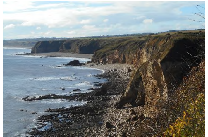
Cliffs and treble arch at Shippersea

This piece of the coast is owned by the National Trust.