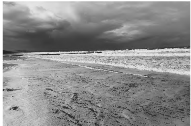
10% rain approaches, Crimdon beach