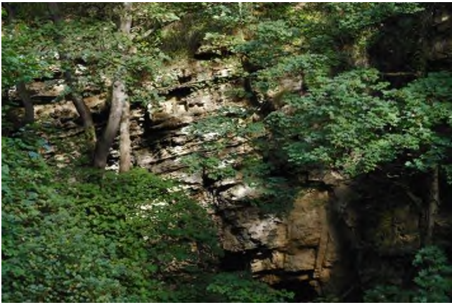
Deep in the den at Hawthorn Hive