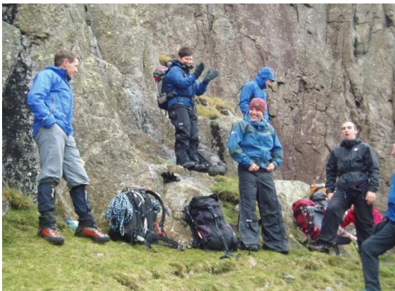
The gang beneath Long Scar

It was bitterly cold and windy, the rock was damp and greasy and to be honest far from ideal for climbing but we wound our way across the boggy moor to Long Scar. A small cliff some twenty minutes from the car and at its base quite sheltered.