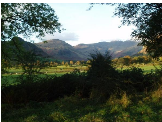
The View from our front door on Sunday