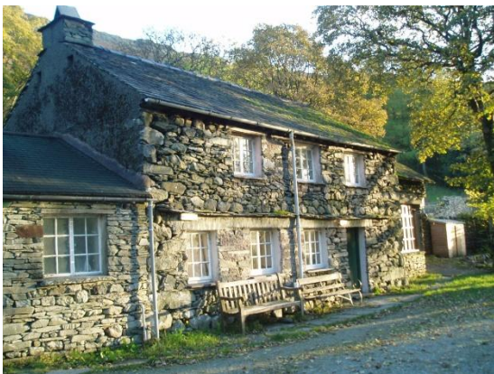
The Wayfarer's Hut RLH