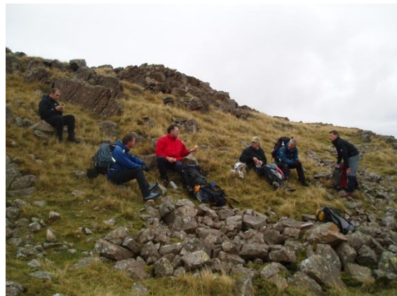
Lunch beneath Great Knott