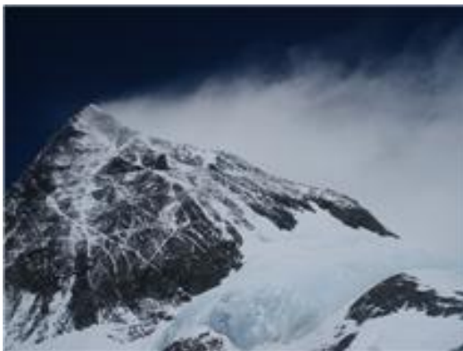
Everest summit from South Col