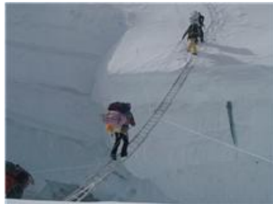
Scary bridge leading into W.Cwm