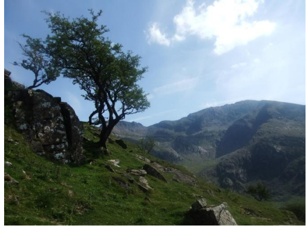
Crib Goch and a Hawthorn Tree ☺