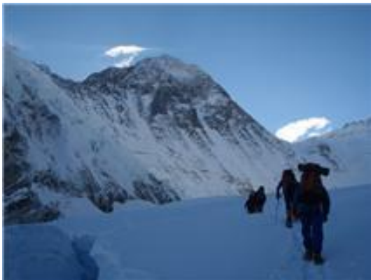
Everest's awesome SW face