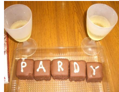
mmm ...cake 😊

Sunday dawned bright and warm, even warmer than the day before so Fiona Langton and I went for another 'short' walk but not before visiting Pete's Eats and the supermarket in Llanberis for much needed fluids – it was going to be a very hot day 😊