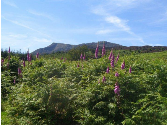
Moel Siabod and Foxglove – great pic ☺