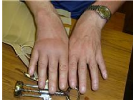
The Chairman's right hand ☺

A much needed cold / beer drink in the Vaynol rounded off another good day and great weekend. If only every weekend could be as sunny !