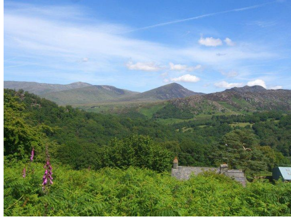
The eastern Carneddau methinks !