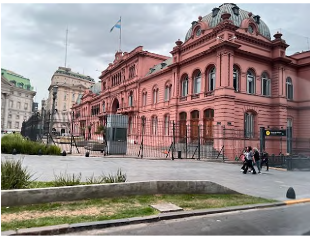
<< Rosada palace with the famous balcony Evita addressed the crowd from.