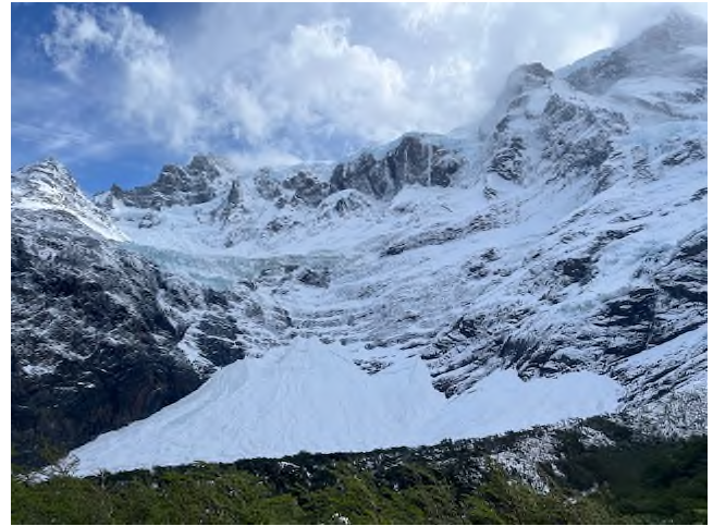
Francis glacier on the hike up the French valley