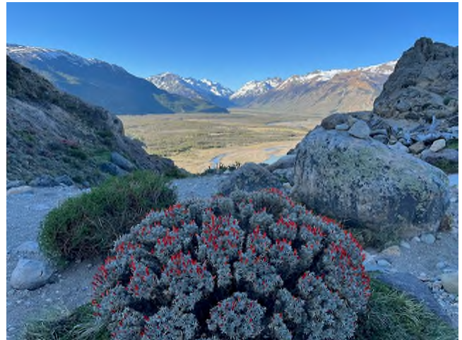
Guanaco bush in flower

In summary an amazing trip great company, stunning mountains, wildlife and lucky with the weather. Definitely a trip of a lifetime.