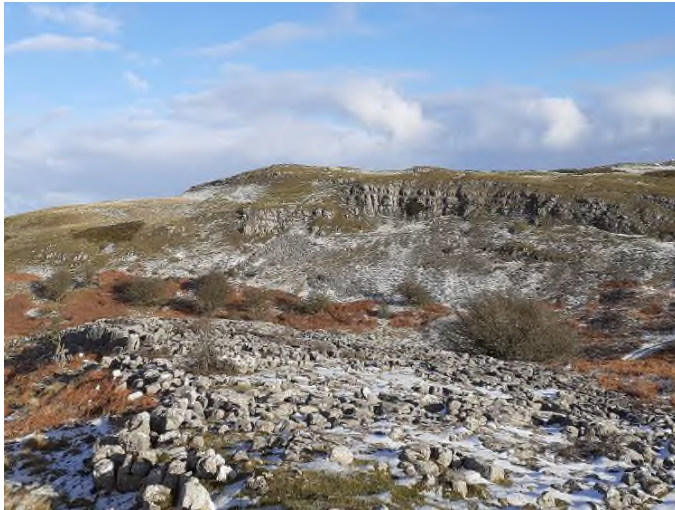
This is a picture of the cliffs of Pt 403 east from the limestone pavement on Pt 403 west, on a bright winter's day.

I guess you might say that the Bryn Alyn hills are 'Clwyds Lite'. They are the limestone hills south east of the A494 which broadly parallel the central Clwyds on the east side of the valley of the River Alyn. The scarp above the river rises to a grassy limestone plateau, from which rise the main summit at 408m (1,338'), and two subsidiaries both at 403m (1,322') roughly to the west and east of the main top. So smaller and more compact than the Clwyds, but these hills and the surrounding area give a good day out with plentiful parking on the A494 opposite the lane to Plymog Farm. There are limestone cliffs, sinkholes, and an area of limestone pavement, so no need to visit the Peak or the Yorkshire Dales to see these things.