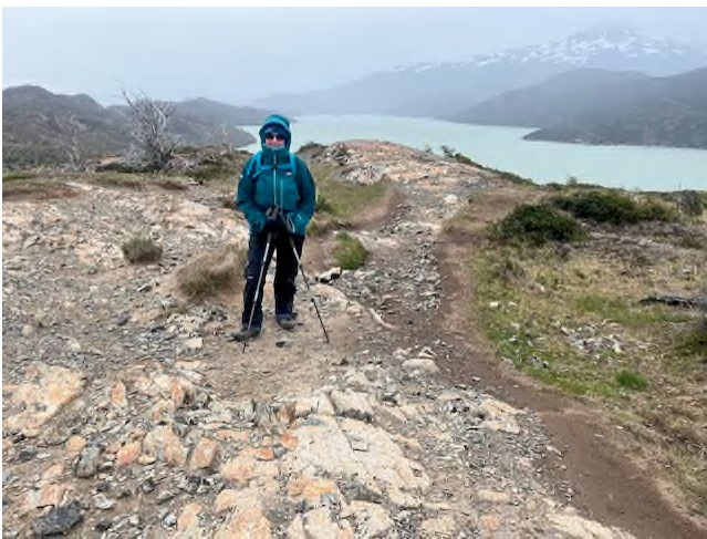
<< Grey day the next day on the way to grey glacier on the w trek