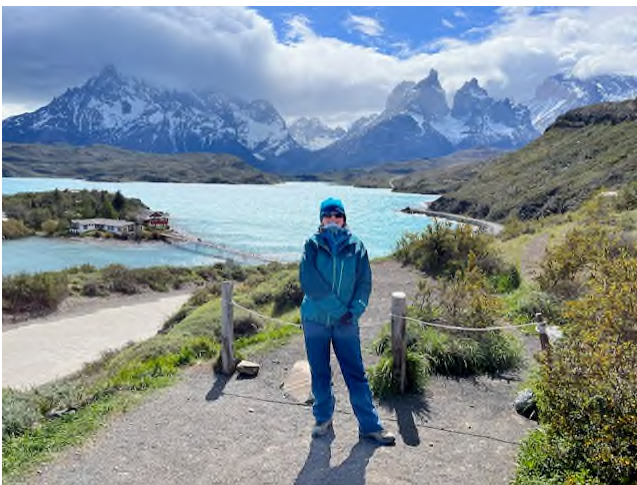
View of the famous Los Cuernos horns in the background before we took the boat across Lake Pehoe to Paine grande refuge.