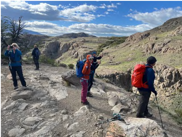
Hike to Cerro Torre viewpoin