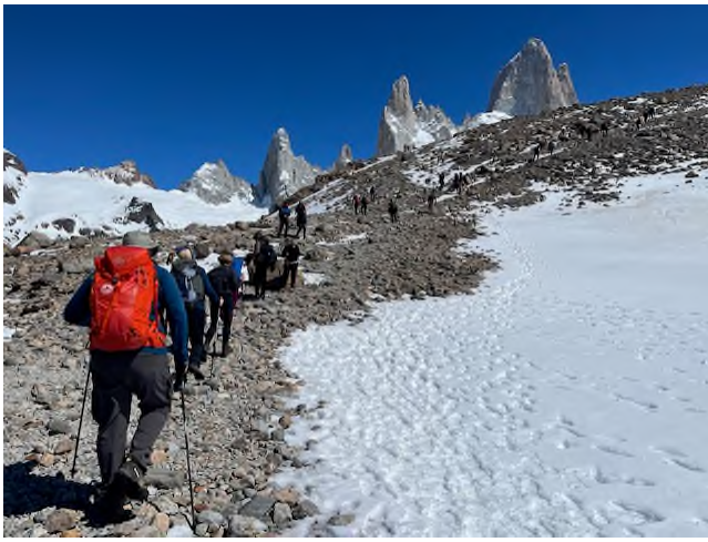
<< Hike to Mount Fitzroy viewpoint at Laguna de Los Tres 14.03 miles 3068ft ascent