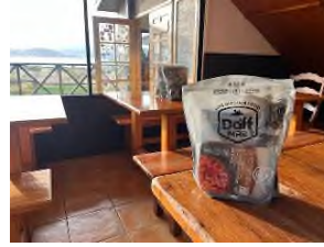
<< Self heating exploding lunch pack !