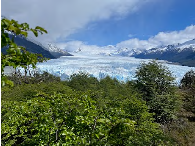
<< Perito Moreno glacier