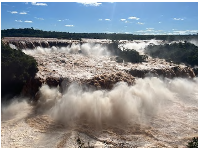
We chose to add on a few days at Iguazu falls well worth it especially the Argentinian side with optional boat trip under the falls. We got soaked!