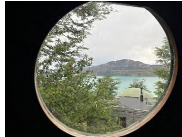
<< View from our Dome at Frances refuge

The only day we had to carry a full rucksack all day on trek was from Frances camping domes alongside Lake Nordenskjold to Chileno refuge (11.57 miles 2712ft ascent) where we camped in their brand new tents with ladders very comfy. Lake Nordenskjold