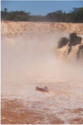
<< Boat trip from the Argentinian side scary but exhilarating!