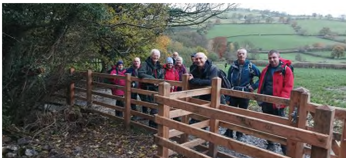
Please note the splendid new fence and gate.

I guess you might say that the Bryn Alyn hills are 'Clwyds Lite'. They are the limestone hills south east of the A494 which broadly parallel the central Clwyds on the east side of the valley of the River Alyn. The scarp above the river rises to a grassy limestone plateau, from which rise the main summit at 408m (1,338'), and two subsidiaries both at 403m (1,322') roughly to the west and east of the main top. So smaller and more compact than the Clwyds, but these hills and the surrounding area give a good day out with plentiful parking on the A494 opposite the lane to Plymog Farm. There are limestone cliffs, sinkholes, and an area of limestone pavement, so no need to visit the Peak or the Yorkshire Dales to see these things.