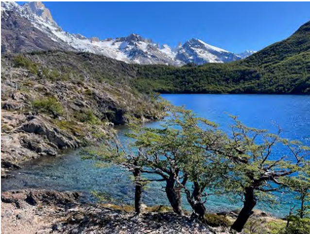
Lenga trees in the foreground

Wildlife on the trip included many birds condors, flamingo, caracaras buzzard eagle, Magellanic woodpeckers rhea and guanacas to name a few. Amazing plants and trees too.