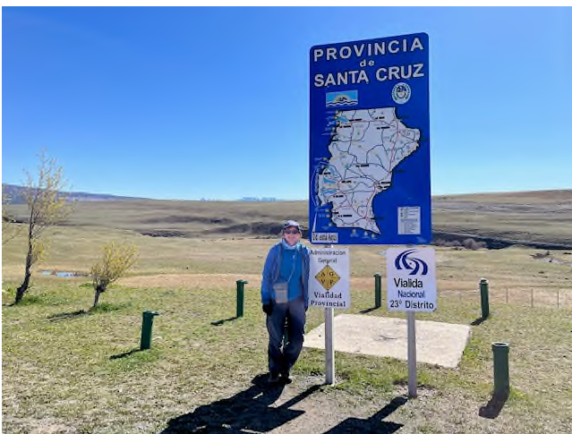
Crossing the Cerro Castillo border into Chile to visit Torres del Paine national park.