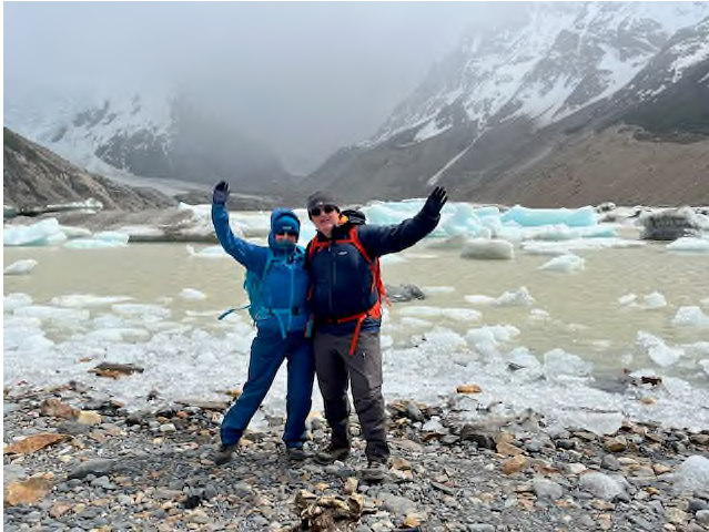
<< Laguna de Los tres with Mount Fitzroy in the background