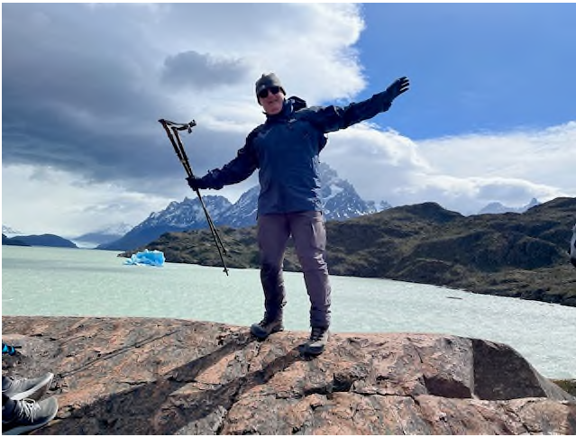
On the trek weather wise we struck lucky with only one dodgy day with near gale force winds and rain on the second day we trekked to Grey glacier which did look very grey that day. The previous day we had better luck from the other side.