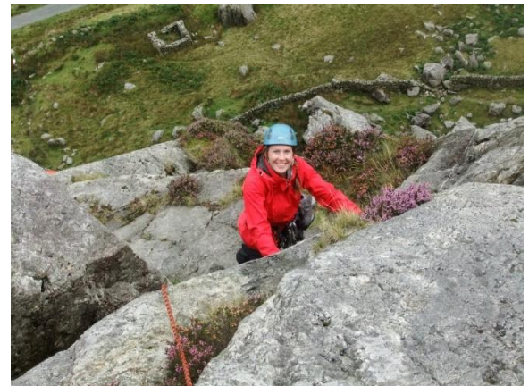
Kerry nearing the top 😊