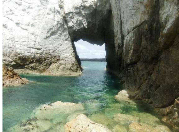
The White Arches