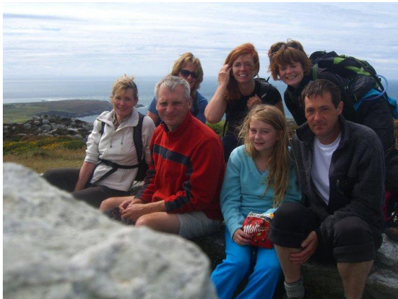
The summit of Holyhead Mountain