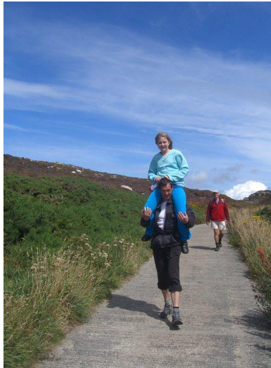
This is definitely the last time I will do this !