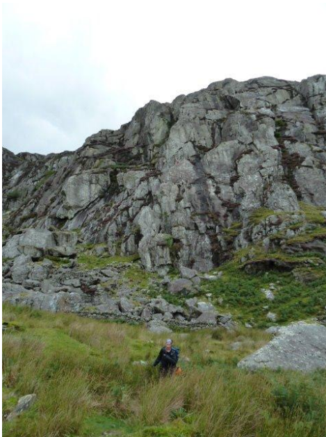
Clogwyn Yr Oen