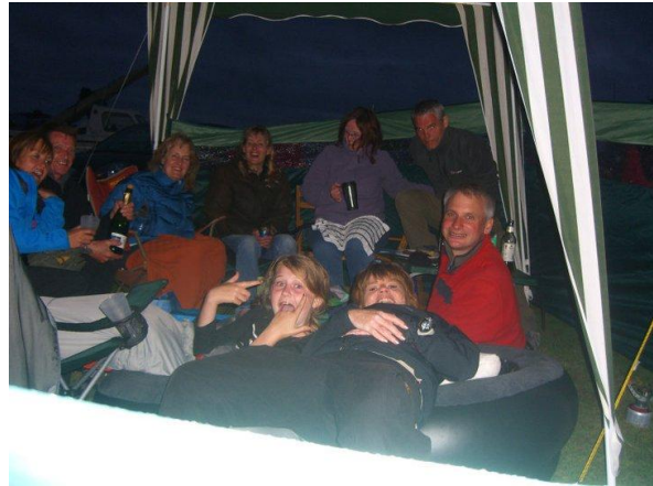
The Gazebo dwellers !!