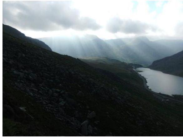
S shafts of sunlight beam down on Llyn Ogwen