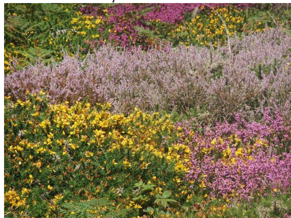
Such beautiful colours ☺

The same weekend we were in Rhoscolyn, Teresa Peddie took time out to assist in the 'Oggy 8' and she kindly wrote the following :-