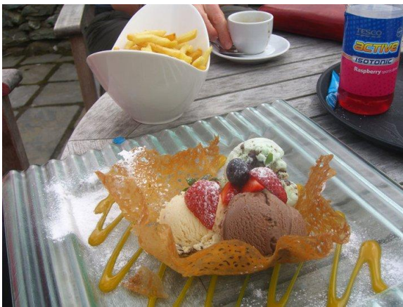
Hollie's Ice Cream !