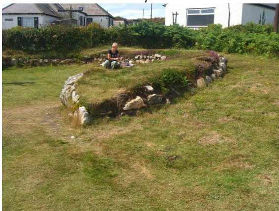
One of the Hut Circles