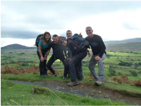
The gang enjoying 'emselves