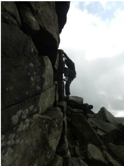
Yours truly on 'Steptoe'