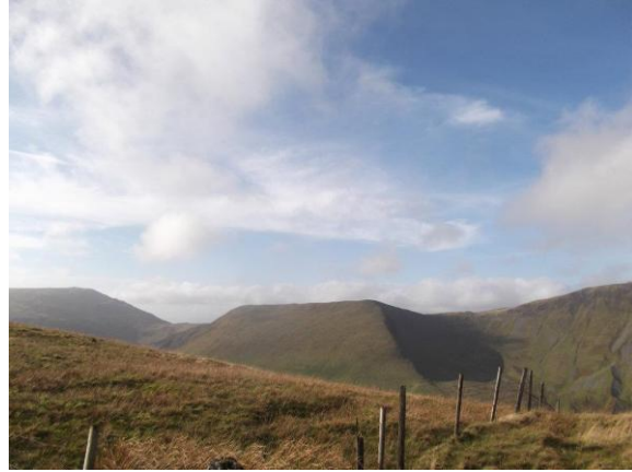
A hill !