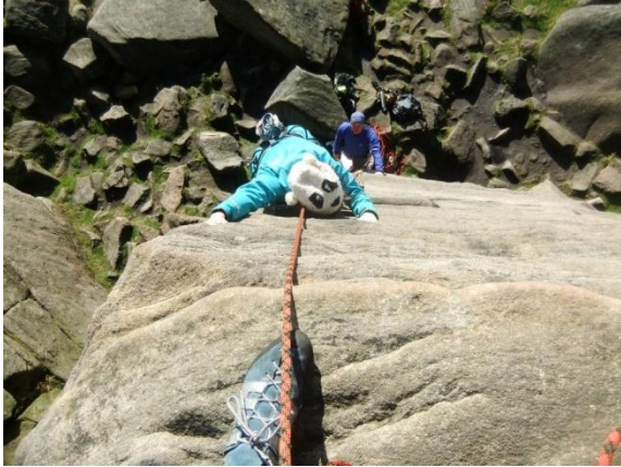
Bethan on Overhanging Buttress Arete