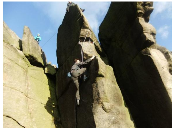
Moi on 'Now or Never'