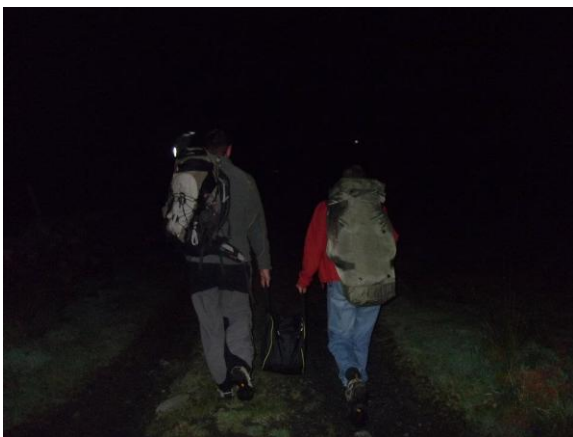
Carrying essential supplies !!

The weather was a bit mixed with Saturday proving exceptionally wet though better weather on the Sunday allowed for a good walk with great views.