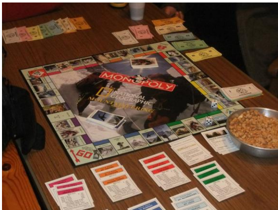
Let the battle commence .....

A cracking evening followed in the Camping Barn, a roaring fire and plenty of nibbles (to say nothing of the booze ☺) ensured a great night in though women and cigars is a definite no-no ha ha !!!