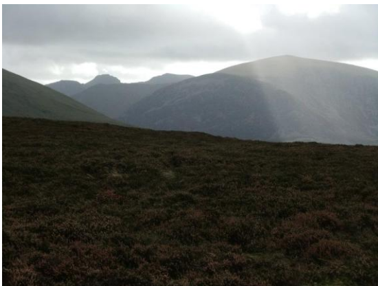
Mynydd Mawr from Cefn Du summit