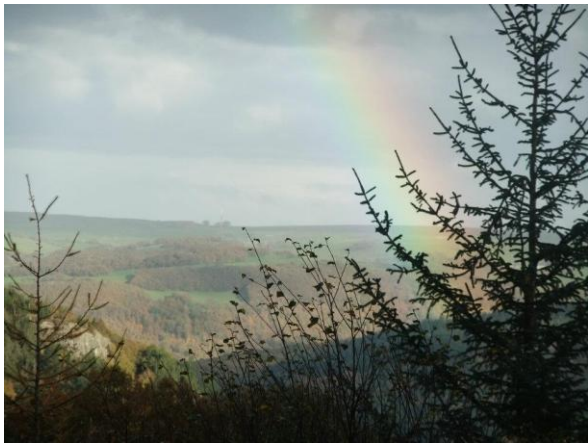
A Rainbow ☺