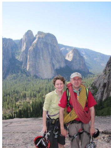
At the top of our 1 st climb