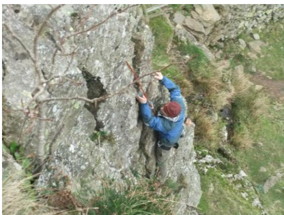
Kev on the first few moves of Via Media