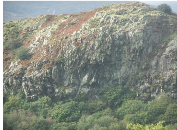
The impressive Carreg Hyll Drem