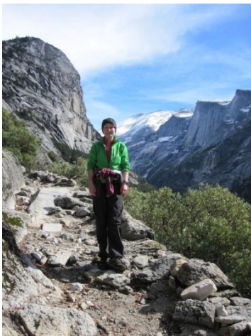
'After the storm !'