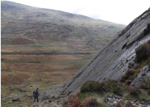
Good old 'ickle' Tryfan