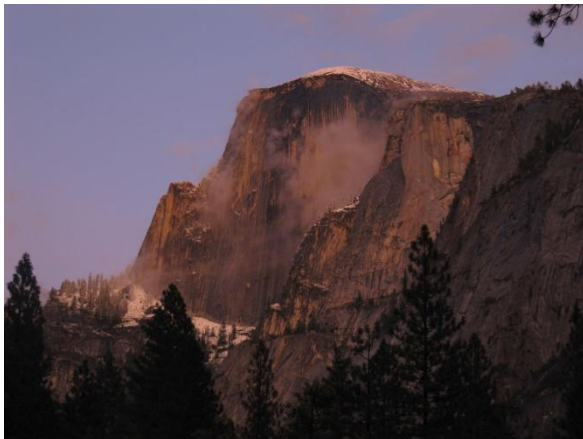
Half Dome with a dusting of snow