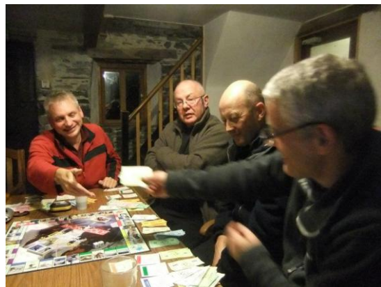
In full flow, it's about to get nasty.....