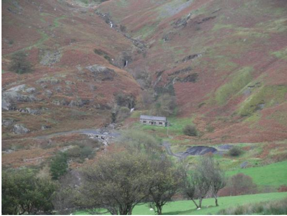
The 'lonely lonely' cottage