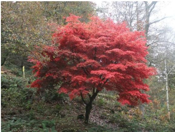
A Japanese Maple