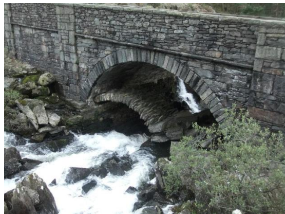
The old bridge at Ogwen on the A5