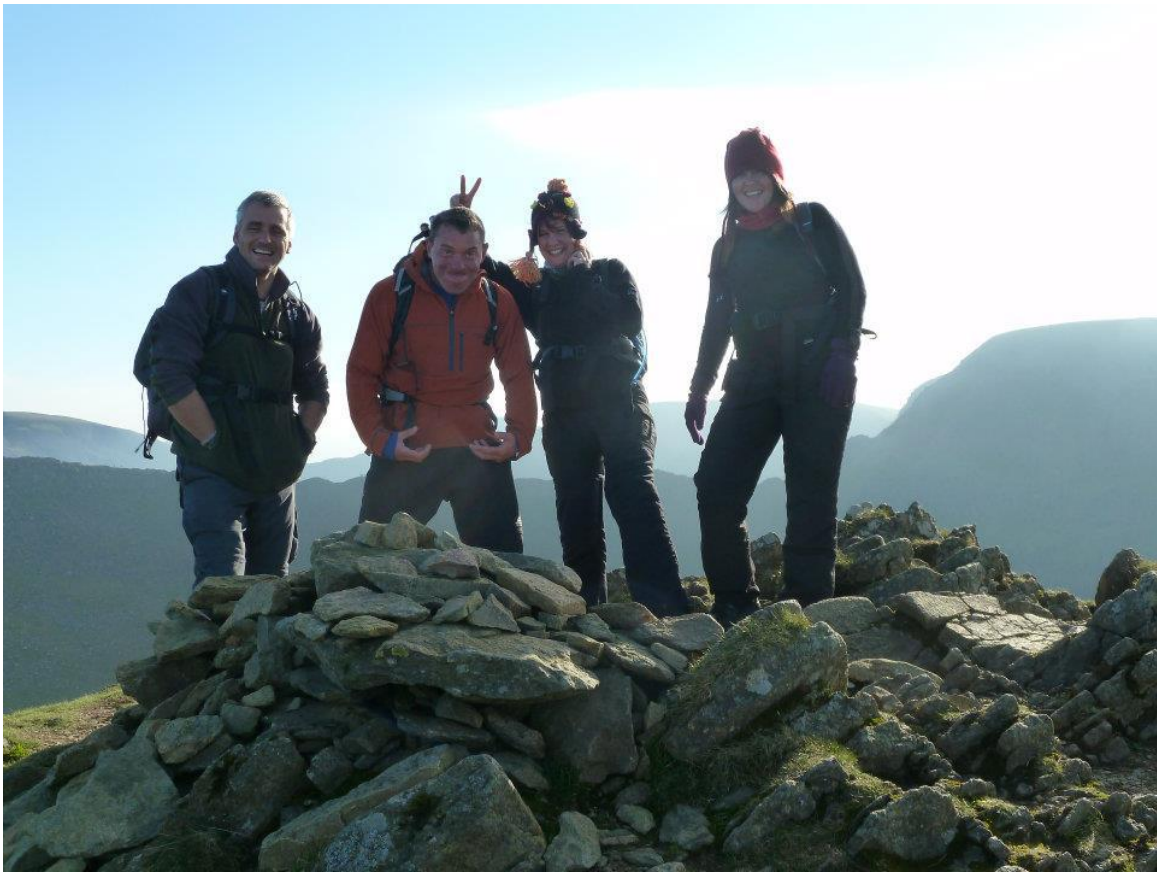
A great picture !!