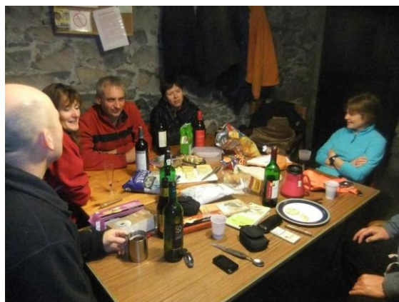
A quiet night in for the Gwydyr