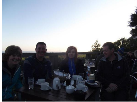
Afternoon tea at the White Eagle ☺

All in all a cracking weekend with superb weather.