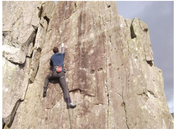
Me on some other horror !!!!