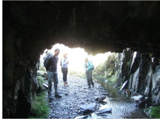
Fiona, Andy & Bethan in the old mining village above Cwm Orthin