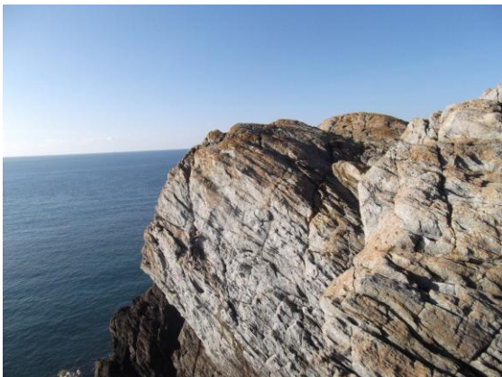
Moi on Fanfare HVS 4C