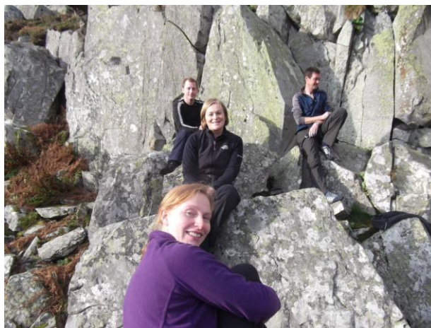
Climbing at the Blocks ☺