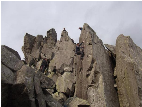
Me on Ginnel Wall