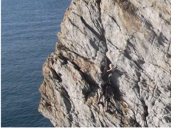
On the steep bit ☺