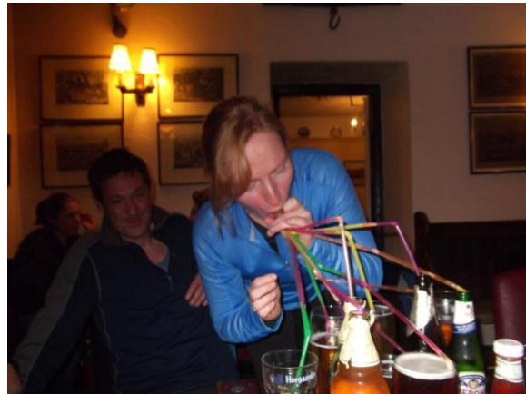
Sunset and Drinking games ☺

The next morning we awoke a little less livelier than the day before, which is an impressive understatement believe me ! The weather showed little signs of improving and so given that three of our party had significantly longer drives to face at the end of the day we headed to Llangollen and Trevor Rocks. We did not forget the seemingly necessary 'cafe-stop' for a second breakfast and under a cold and cloudy sky we made our way to the Railway Buttress where we sorted out a climb and abseil session which was great fun.