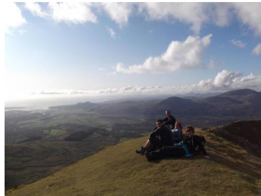
The team on top of Moelwyn Mawr