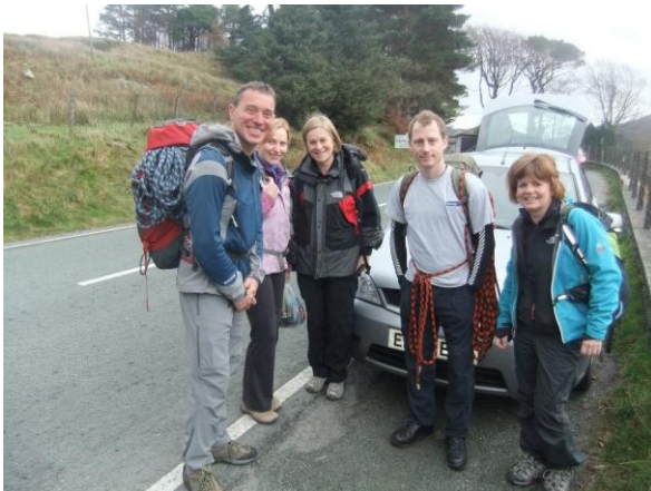
The gang – minus me !!