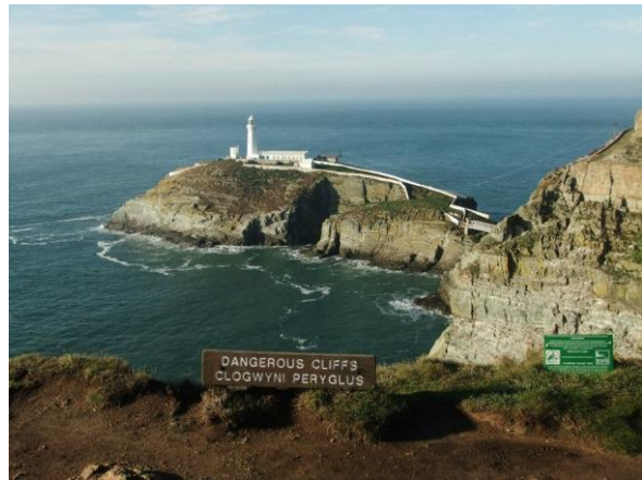
South Stack ☺

I'm sure you'll agree from the pictures we had great weather and a great day out ☺