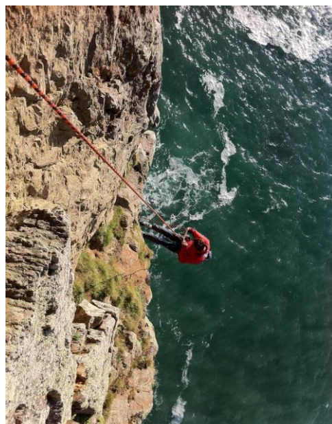
The Abseil down to the start