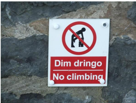
Oh yeah ! We'll see about that ☺