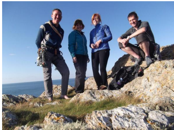
The gang on top ☺