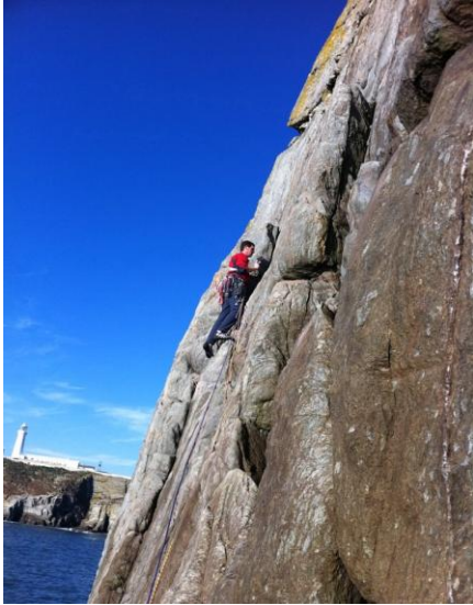
Moi on 1 st pitch