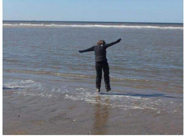
Ten days after dipping her feet into the River Severn