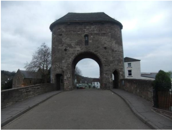
The Medieval bridge at Monmouth