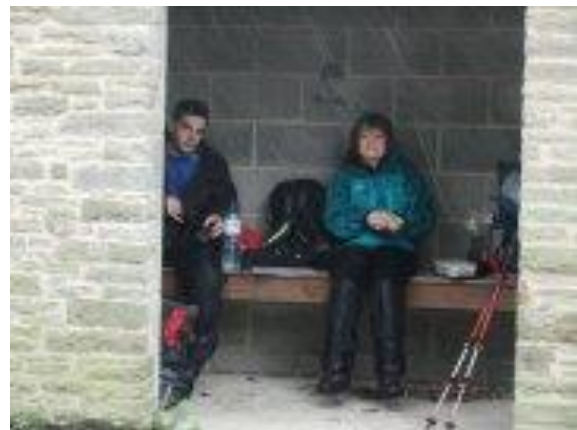
Sheltering in a bus stop at Newchurch ☹️