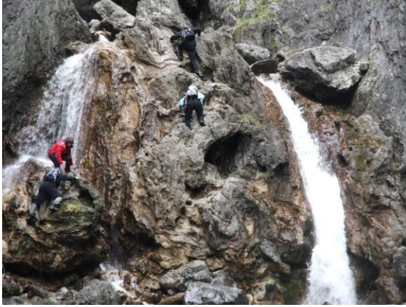
It's not as steep or wet as it looks ☺