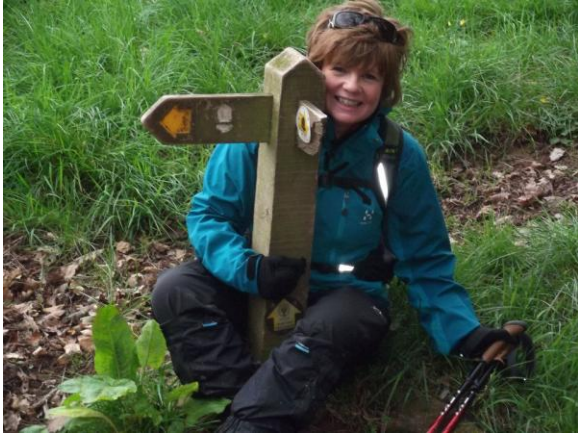
The path is very well signposted for dwarves ☺