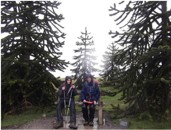
A wet day on Hergest Ridge above Kington