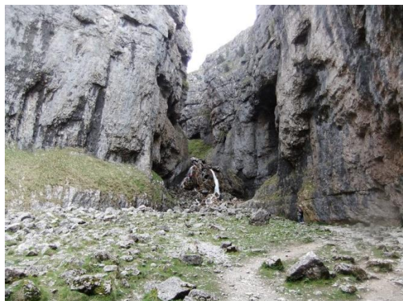
Goredale Scar – the path climbs the waterfall !!