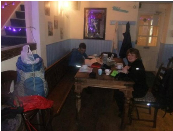
The White Swan in Kington – great lunch stop 😊