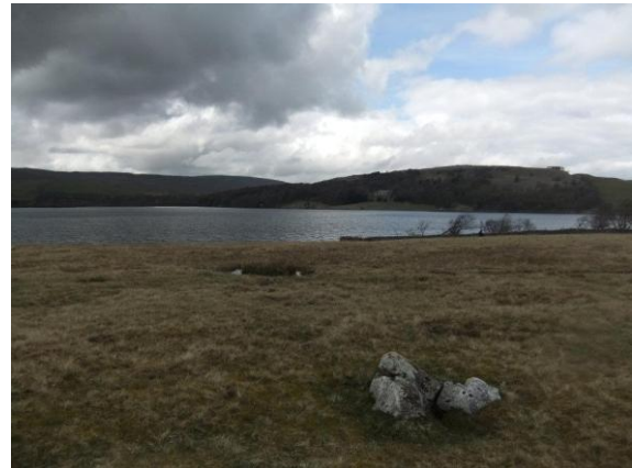
Malham Tarn, only 14ft deep apparently !