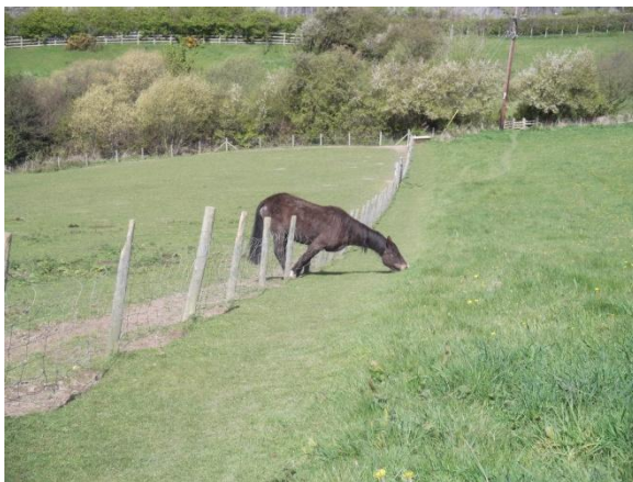
Who said the grass is always greener .....