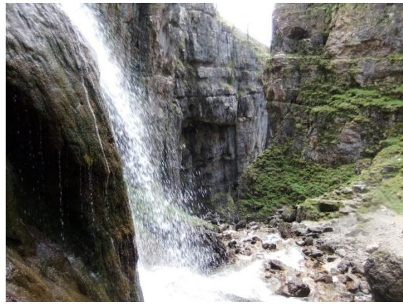
Goredale Scar scrambling and the upper falls ☺