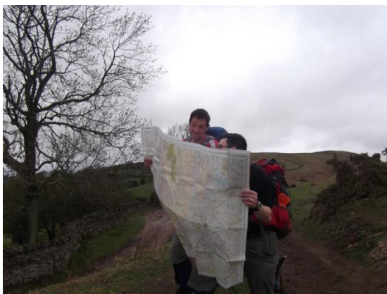
It's this way I'm sure.....