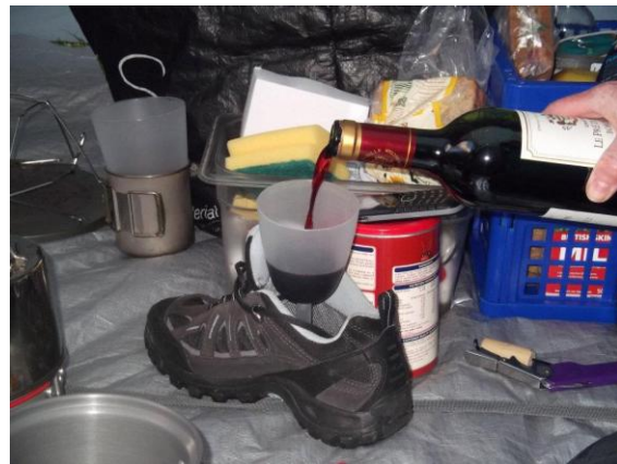
Yorkshire Dales snapshots 😊