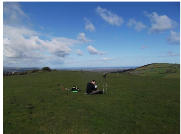
Steve and the sea now visible ☺