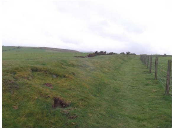
Offa's Dyke above Kington