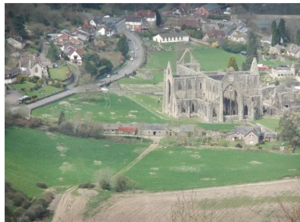
Tintern Abbey from the Devil's Pulpit