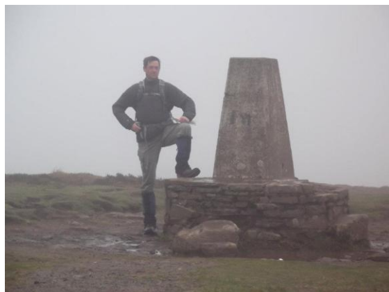
The Chairman on Hay Bluff @end of Black Mtns