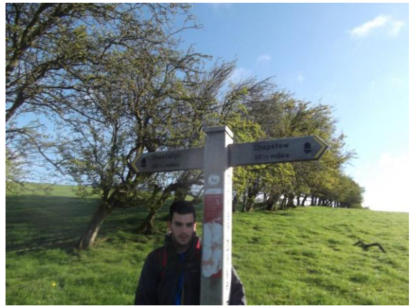
Half-way there now ☺