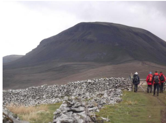
Pen Y Ghent before the rain came in