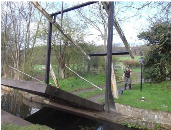
A bridge over the canal