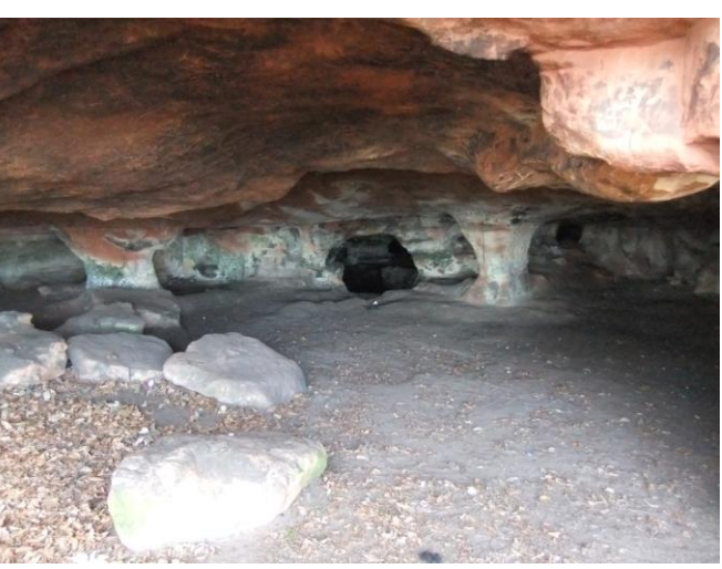
Queens Parlour Cave.