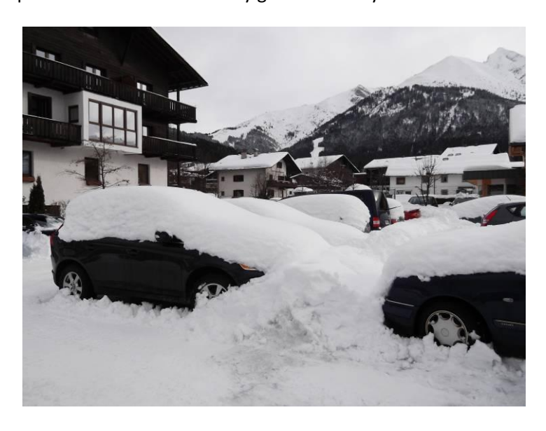
We were glad we didn't take the car

We bought the 12 euro bus pass for the week and easily got our money's worth.