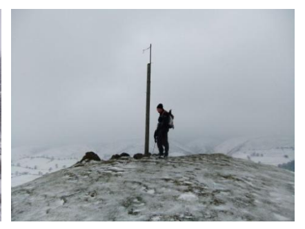
A snowy Shropshire landscape ©

Jim Metcalfe has been out in the snow as well and kindly emailed me the following – thanks Jim ©