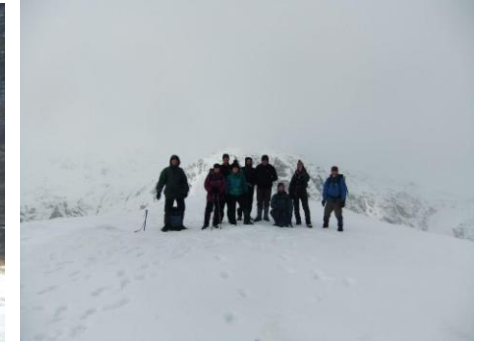
A party of ten heading Pen Yr Helgi Du – before the maelstrom !!!