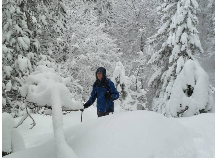
All you need to do is follow the markers on the trees