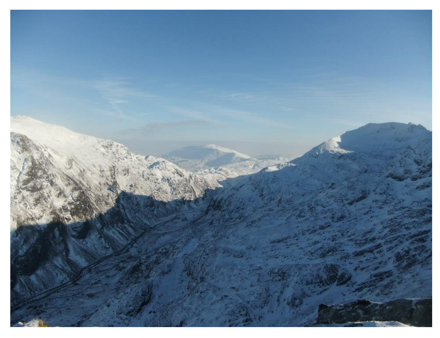
Crib Goch & Moel Siabod from Llechog

Welcome all to the latest newsletter and it's great to see that winter is still with us ©