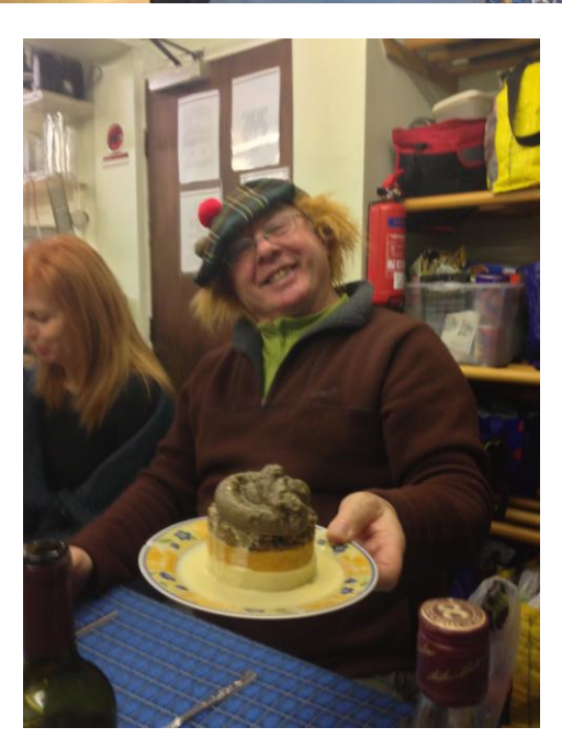
Some Pictures of the Burns Night festivities

The walk prior to the meal proved interesting for most and hard work as well given the wind and thigh deep snow on the Carneddau.