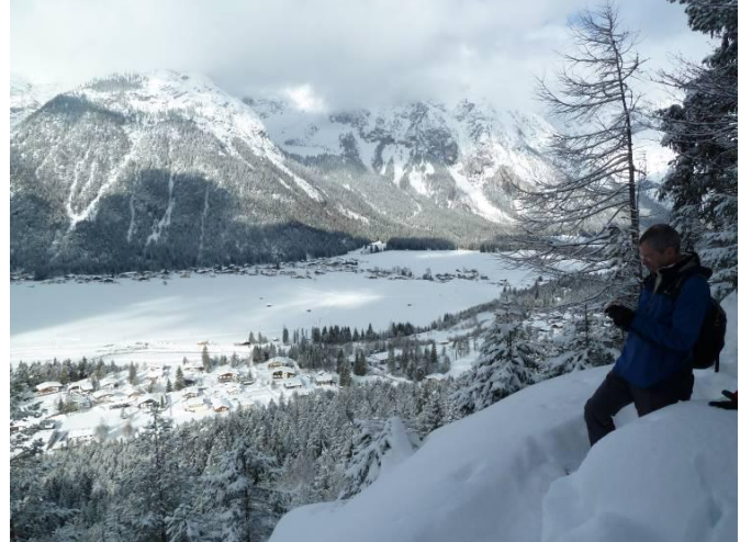
There were plenty of benches for lunch stops