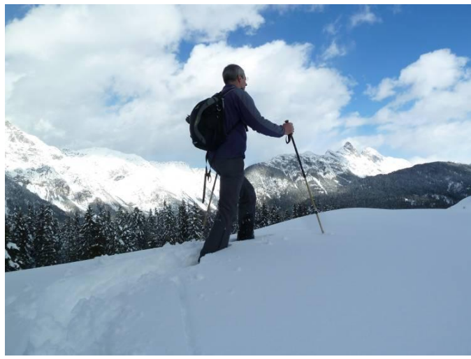
The views were amazing