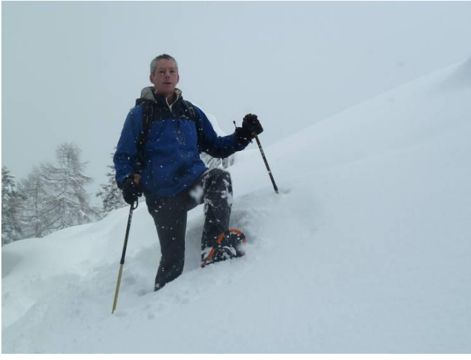
Paths were well signposted