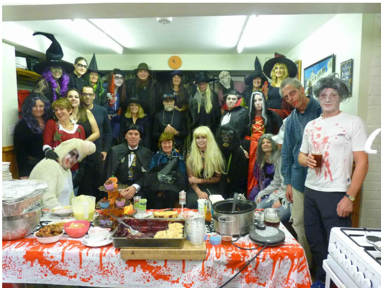
A BRILLIANT PICTURE ☺